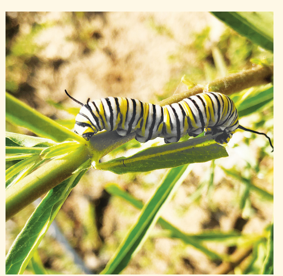
A Western Monarch caterpillar eating a native narrowleaf milkweed, Asclepias fascicularis.

Surveys involve stooping, bending and kneeling on the ground. Ability to use a smart phone with the iNaturalist app is helpful but not required.