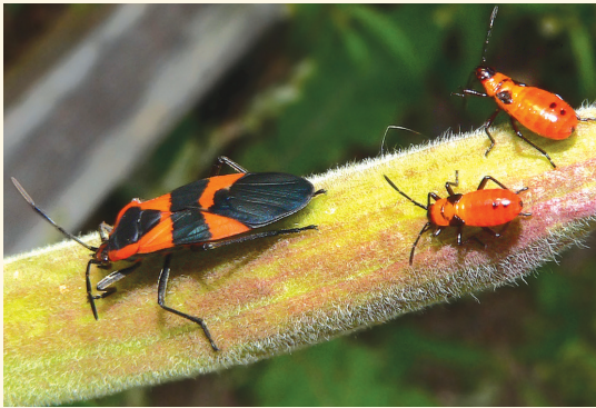
Milkweed Bug ( Berberis nevinii )

Common milkweed pests include aphids, white flies, milkweed bugs, scale insects, spider mites, thrips, and leaf miners.