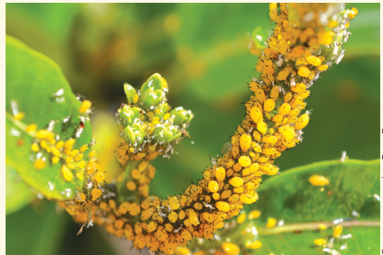
Oleander Aphids ( Aphis nerii )