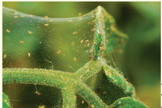
Spider Mites ( Tetranychidae )