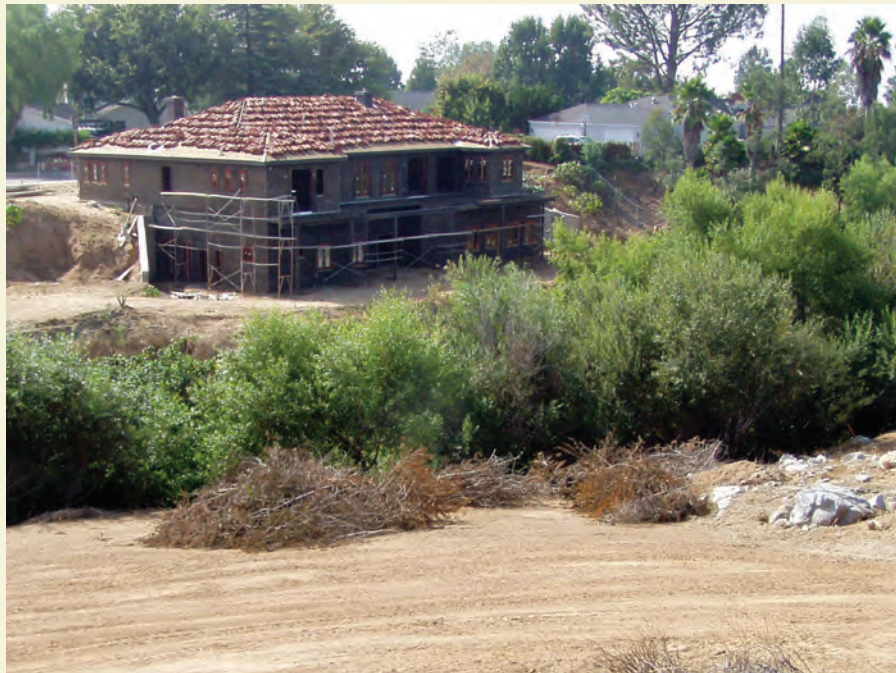
Encroachment too close to a waterway compromises its ability to function properly.

If you need technical assistance with erosion control, such as stream bank stabilization, contact your local Resource Conservation District and/or the Natural Resources Conservation Service.