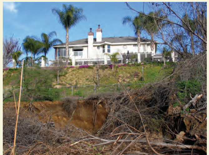
Improperly designed home sites encroach on waterways and do not provide a buffer to protect homes, water quality and arroyo habitat.

Through careful design, applicants may be able to avoid impacts to a waterway, and thus reduce permit requirements. For example, a landowner might install a free-spanning bridge, rather than a culvert for a road crossing, thus avoiding earth movement and vegetation removal from a waterway. Streamside vegetation helps control erosion, provides habitat, and removes pollutants from water. Preserving vegetation saves the cost of erosion control and habitat restoration.