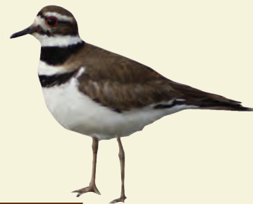
Kildeer BY EDITH MARACLE

Timing of work is an important consideration in preventing disturbance during breeding and nesting seasons and to prevent erosion during the rainy season. A project's Storm Water Pollution Prevention Plan (SWPPP) will require that erosion control measures be installed prior to earth movement.