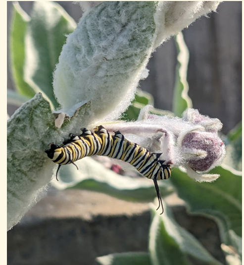
A Western Monarch caterpillar eating a native California milkweed, Asclepias californica .

Surveys involve stooping, bending and kneeling on the ground. Ability to use a smart phone with the iNaturalist app is helpful but not required.